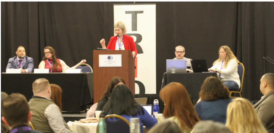
NEOA annual business meeting