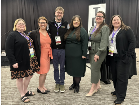
NEOA Executive Leadership Institute Participants at the conference