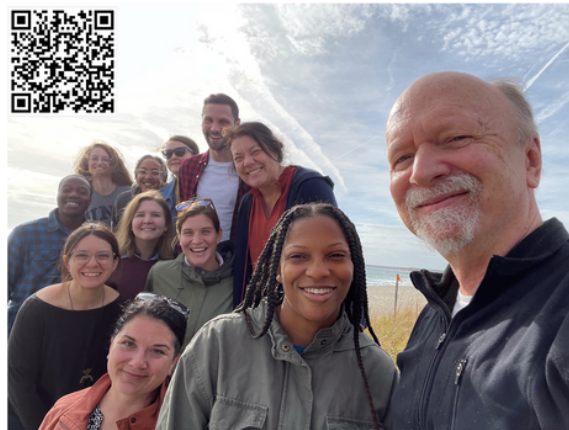
AMLI Class of 2023

Details including the application packet may be found via the QR code or URL below.