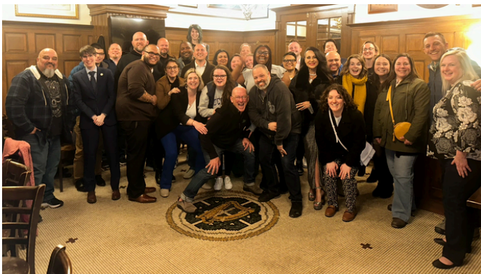
NEOA members and alumni at Policy Seminar

Please make sure to reach out to your Senators to request that they sign on to the letter. The staffers for each Senator can be found here .