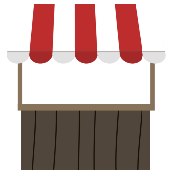
Re-creation of NEOA PD Booth!