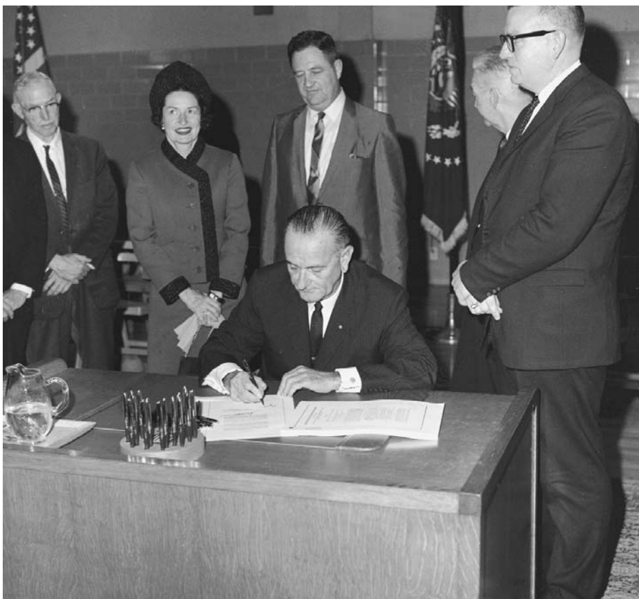
President Lyndon B. Johnson signs the Higher Education Act of 1965.

programs. A program for high school students called “Upward Bound” was one of the first demonstration programs to be developed. Its purpose was to identify secondary school students from low-income backgrounds who were underachieving, and to motivate and prepare them to pursue postsecondary education. Seventeen pilot projects began operation in the summer of 1965 serving 2,061 students. 6