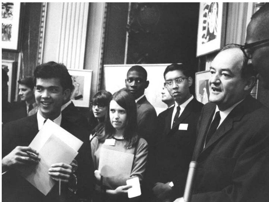
Vice President Hubert Humphrey (far right) meeting with Upward Bound students.

This was the first time this particular population of students had been recognized for special consideration in an education law.